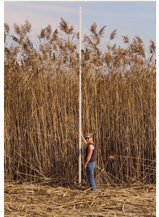
Identifying Invasive Phragmites.