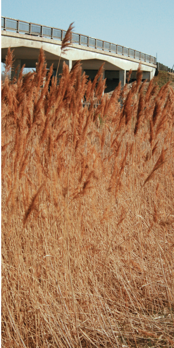
Invasive Phragmites growing next to a highway.

Invasive Phragmites (European Common Reed) is an invasive plant causing damage to Ontario's biodiversity, wetlands and beaches. Invasive Phragmites is a perennial grass that has been damaging ecosystems in Ontario for decades. It is not clear how it was transported to North America from its native home in Eurasia.